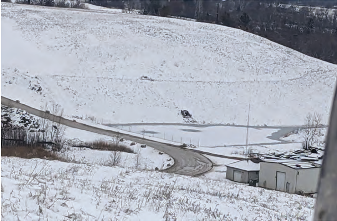
Start at access road by pretreatment plant