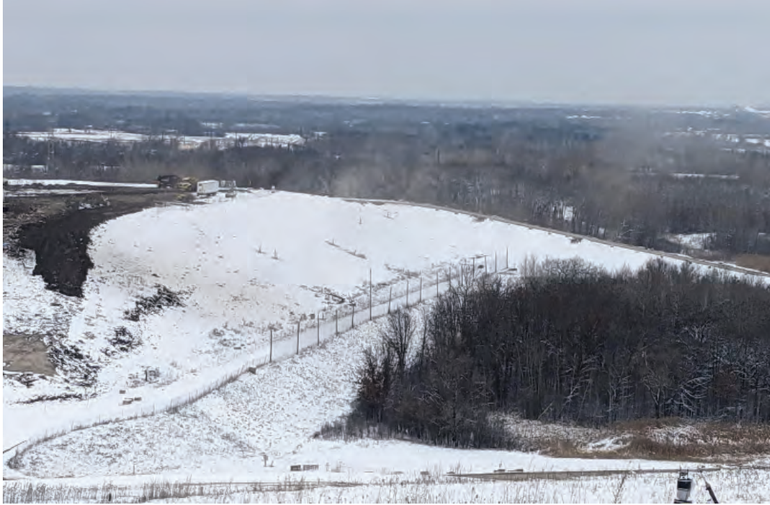
Cover placed as working face meets grade to shape East slope