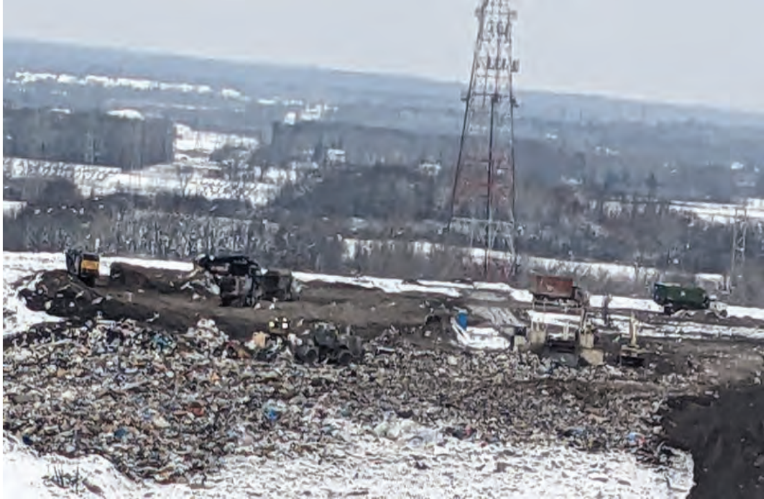
Top of Phase 2 receiving waste and clean-out of trucks