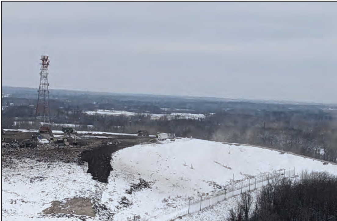
Working face on East edge of Phase 2, West edge of Phase 1