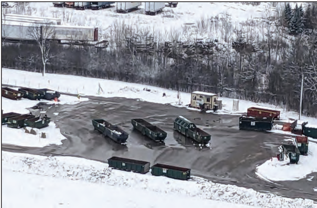
Resi-drop-off, clean and cleared of snow