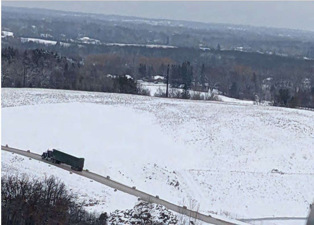
Access road passing stockpile prior to North Expansion West