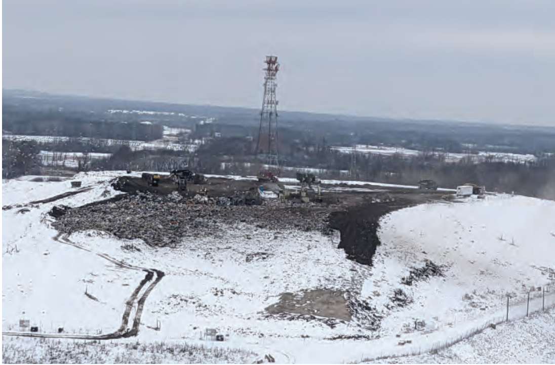
Over all view of Phase 2