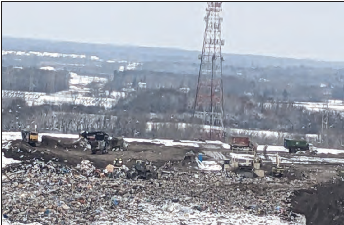
Truck clean out Phase 2b