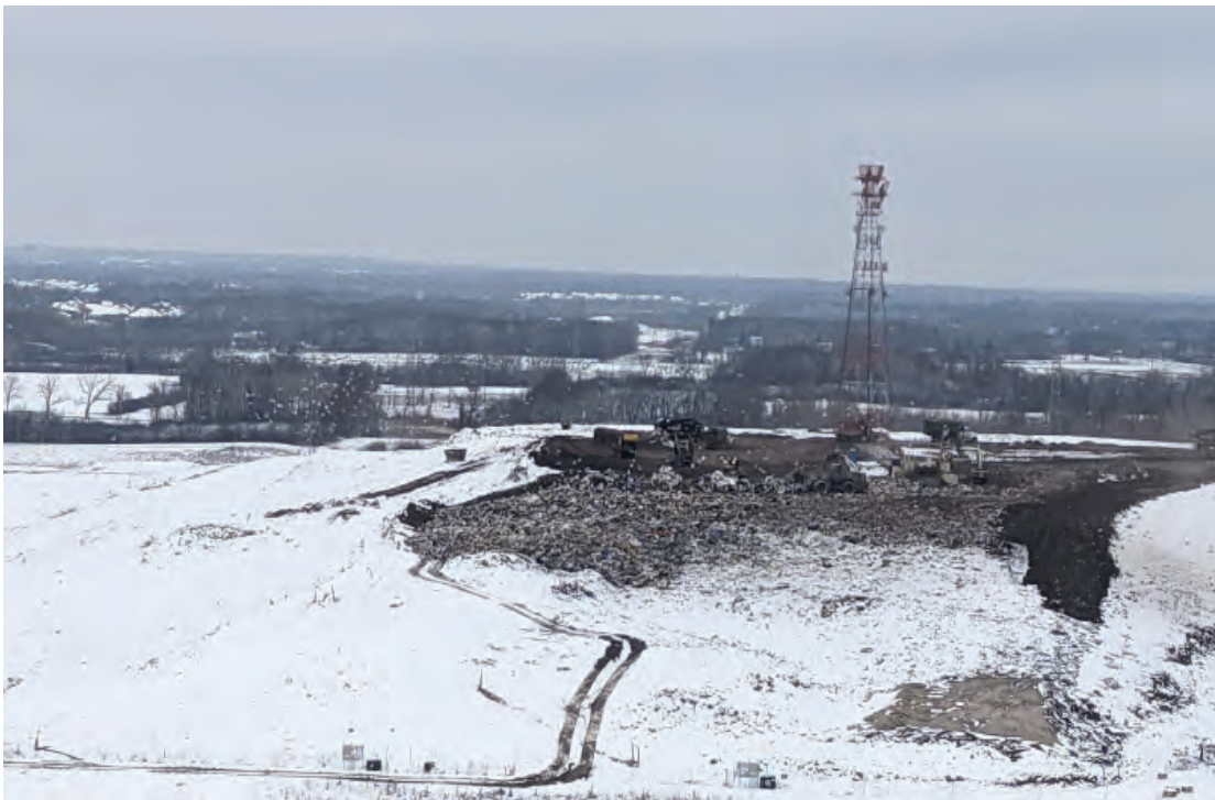
Southwest corner of Phase 2B, receiving some waste to shae corner